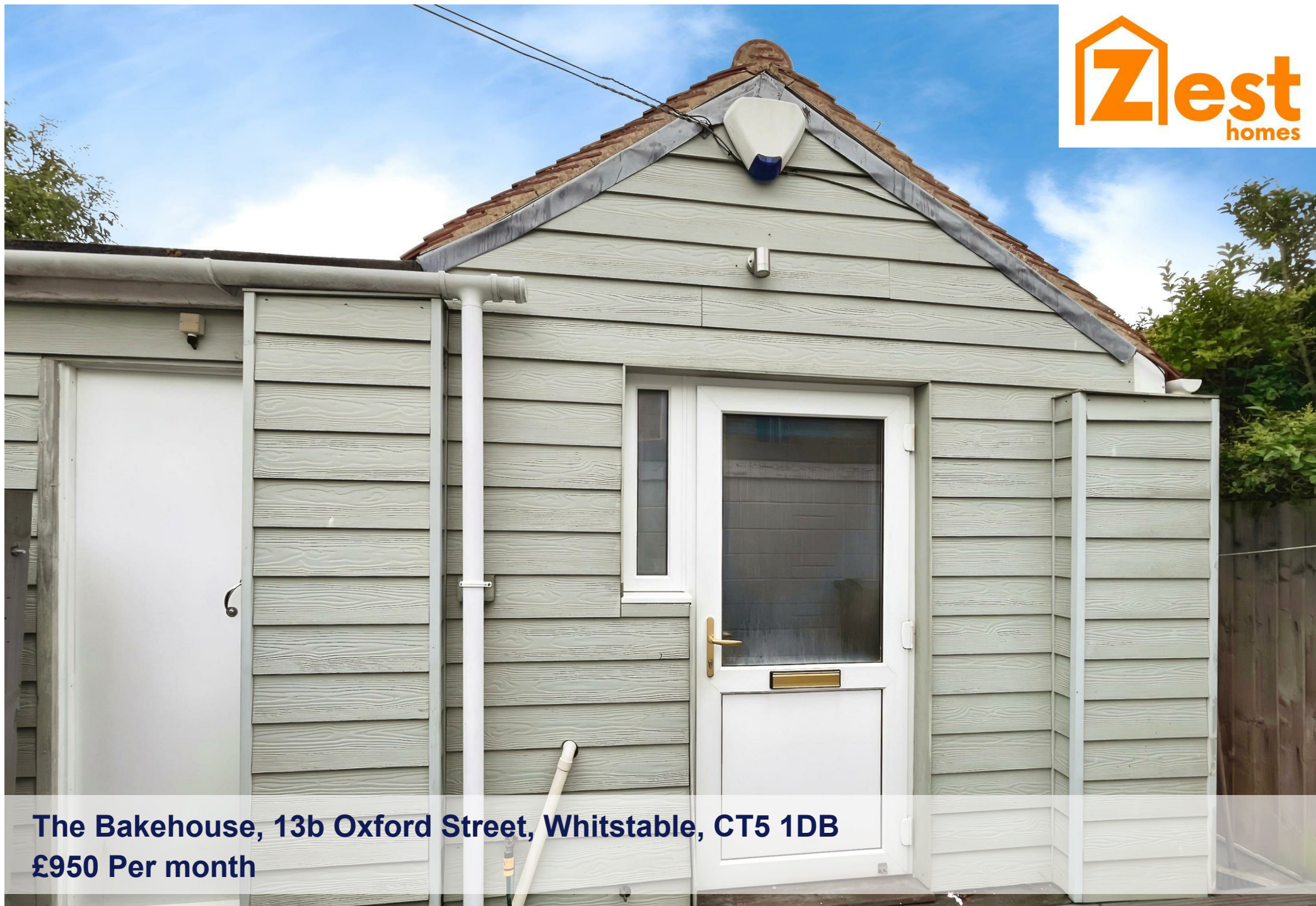
The Bakehouse, 13b Oxford Street, Whitstable, CT5 1DB £950 Per month